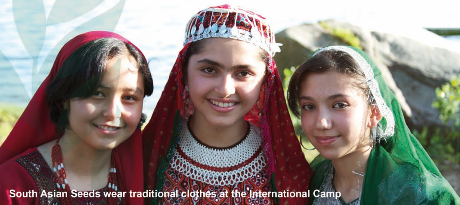
South Asian Seeds wear traditional clothes at the International Camp