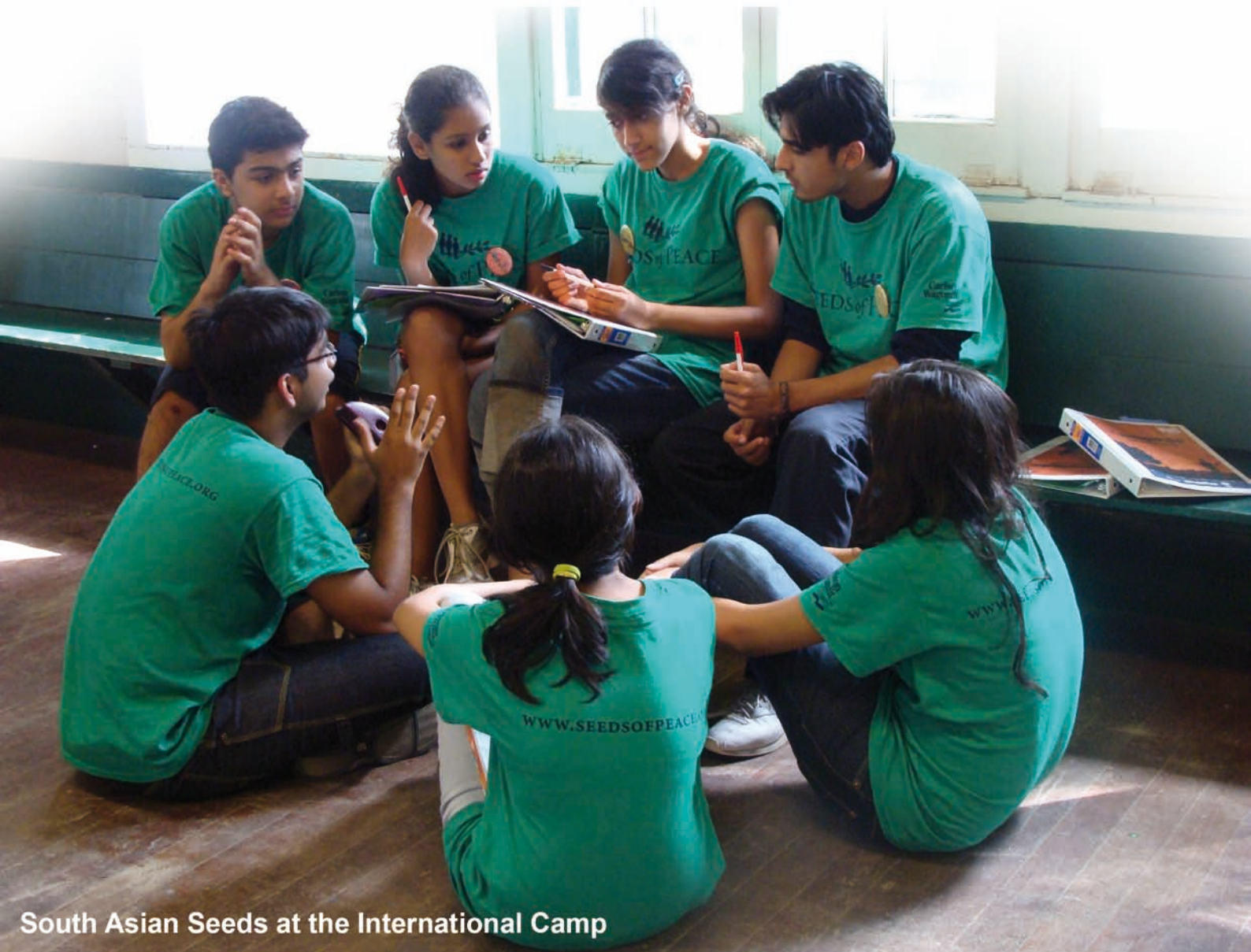
South Asian Seeds at the International Camp

Through dialogue, campers gain insights into the dynamics that perpetuate their conflict, and lay the groundwork necessary for exploring and addressing those dynamics through Seeds of Peace regional programs once they return home.