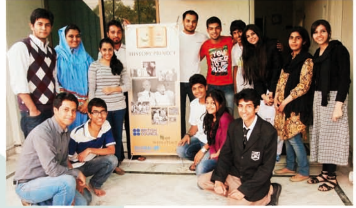
Seeds at the History Project workshop in Lahore

Pakistan's reliance on narrow curriculum creating two camp opportunities in Lahore to teach students the skills often left out of the classroom, including critical thinking, leadership, and responsibility.