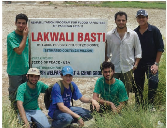
Seeds visiting the site of the reconstructed school

All funds raised were utilized toward the reconstruction of 20 houses in the city of Kot Addu, and the reconstruction of two schools where eventually